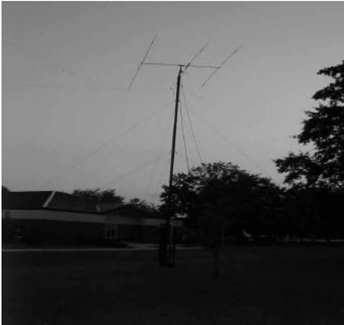
SSB Antennas towering in the sky!!!