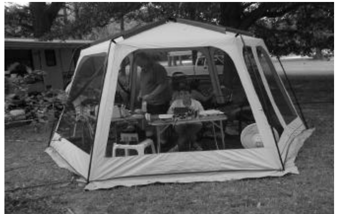
VHF and MF station in operation during Field Day